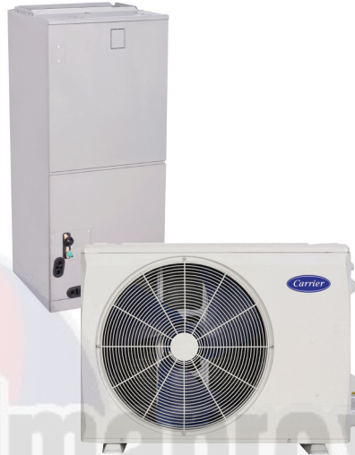
MODEL 38MURA HEAT PUMP with 40MUAA AIR HANDLER

Carrier was the first to offer systems with Puron® refrigerant, which does not contribute to ozone depletion. By replacing an older, less efficient horizontal heat pump with a Performance Series system, you could reduce your energy use and environmental impact.