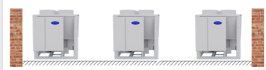
Chillers side by side with brick walls at the end

Carrier can give you the confidence of knowing you have the right chiller like no other manufacturer can. Our new ExpertFit Modeling Software can illustrate what chiller capacity is possible within the space you have available, and what performance you can expect from the chiller. In other words, you can be sure you're getting a chiller that's an expert fit for your application.