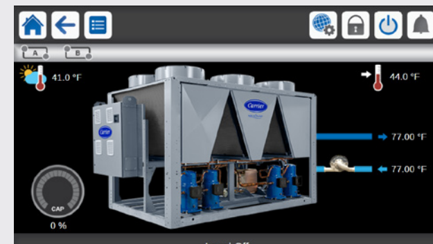
User-friendly controls, a color touchscreen display and a self-optimizing control feature make it easy to achieve optimum performance for any given set of conditions.