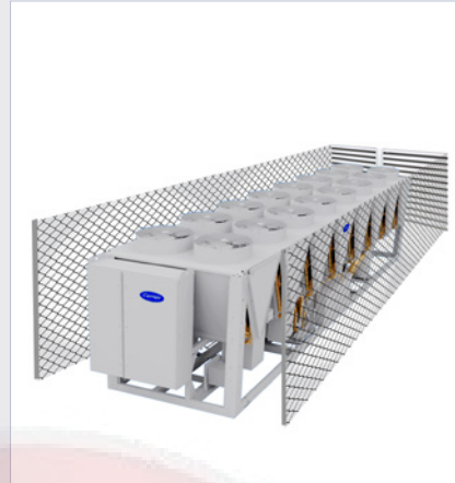
A chiller between chain-link and louvered walls