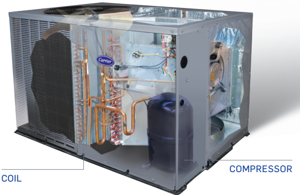
50ZP PACKAGED AIR CONDITIONER SHOWN

The 50ZP packaged air conditioner and 50ZH packaged heat pump are built to look their best while enduring exposure to hail, errant soccer balls, lawn equipment and more.