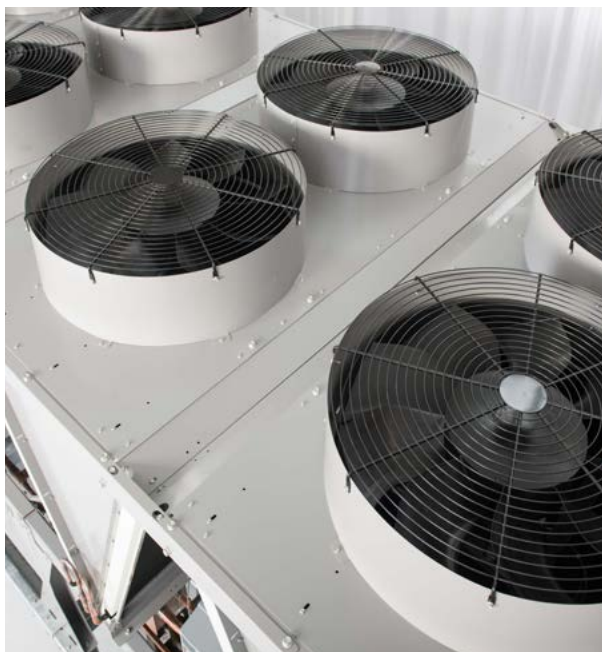
Quiet AeroAcoustic® fan system

For applications that require the unit to quickly recover after a power supply interruption, the 30XV has you covered. Plus, it's more than a quick restart. The 30XV is able to recover to its full cooling capacity within four minutes after the interruption.