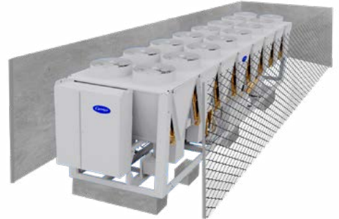
A chiller between chain-link and solid walls