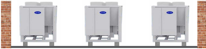
Chillers side by side with brick walls at the end

Carrier can give you the confidence of knowing you have the right chiller like no other manufacturer can. Our new ExpertFit™ Modeling Software can illustrate what chiller capacity is possible within the space you have available, and what performance you can expect from the chiller. In other words, you can be sure you're getting a chiller that's an expert fit for your application.