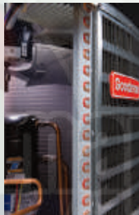
Goodman's SMARTCOIL™ 5mm tube condensing coil design optimizes the heat transfer ability of R-410A refrigerant compared to standard 3/8" copper tubing.

You can count on your Goodman brand GSX16 Air Conditioner to keep you cool on even the hottest summer days. Your Goodman brand air conditioner starts with a high-performance compressor that operates in tandem with our high-efficiency coil. The coil is made of rifled refrigeration-grade copper tubing and corrugated aluminum fins in a design that maximizes surface area. These high-quality components together cool your home effectively.