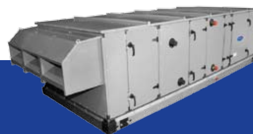
39M Aero™ (Outdoor) 1,500 to 60,500 cfm