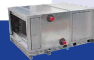
39L 1,800 to 15,000 cfm