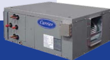
39S 400 to 8,500 cfm

For all your comfort needs, Carrier has the right level of control.