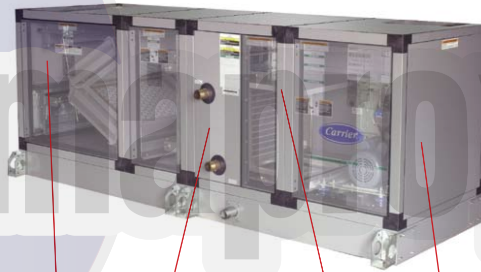
Agion Antimicrobial Coating